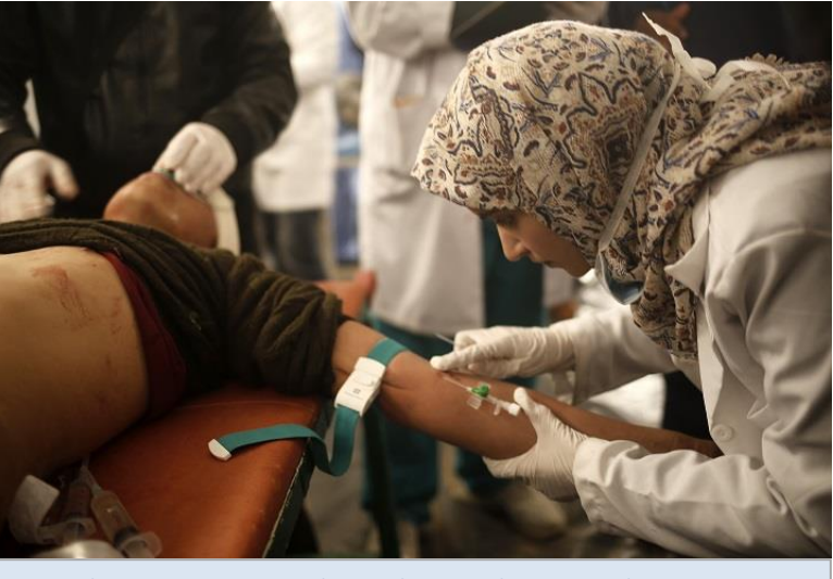
Injured patient receives pre-hospital care at the TSP.