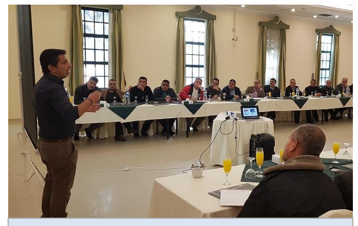
TSP workshop.