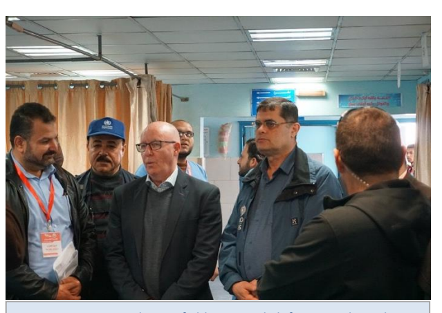
Humanitarian Coordinator field visit to Al Shifa Hospital