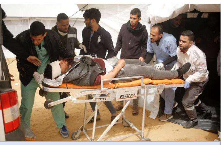
2,135 people were injured on 30 March.

An additional $1.5 million is required to ensure the minimum needed resources are available to prepare for and respond to the first 96 hours of potential escalation.