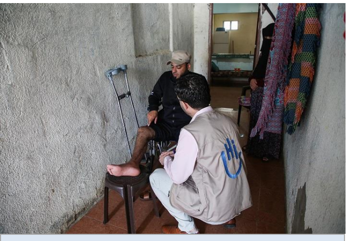
Photo: HI team interviewed PwI to identify his needs in terms of referral.