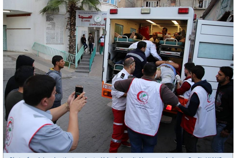
Photo: four injured patients arrive to Al Awda hospital in one ambulance. Credit: UHWC

In November and December, electricity from