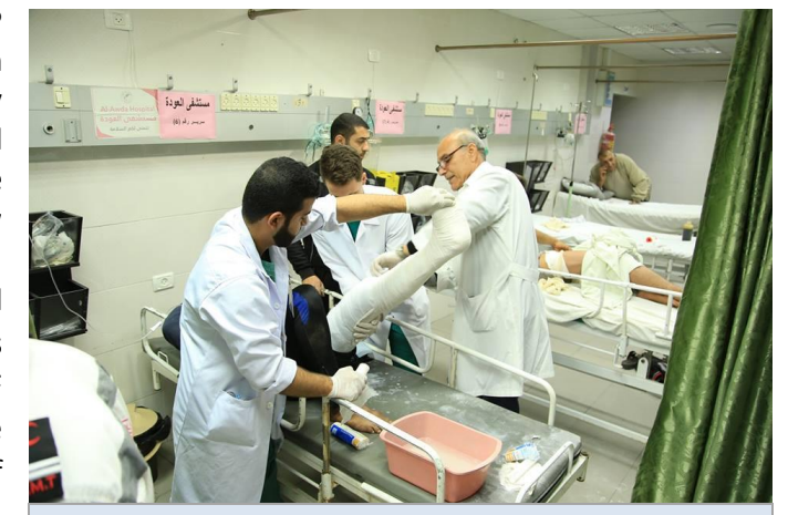
Injured patient receives emergency hospital care in the Al-Awda Hospital.