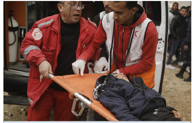
Injured patient transported to the TSP to receive pre-hospital care.