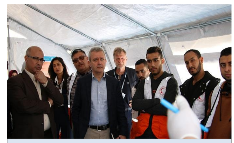
The WHO Regional Emergency Director visits a PRCS TSP in Gaza.

■ The Health Cluster partners also require $ 32 million USD to address health needs of the most vulnerable communities in the occupied Palestinian territory for 2019, targeting 900,000 people out of the 1.2 million people in Gaza, West Bank (including East Jerusalem). See the Humanitarian Response Plan 2019.