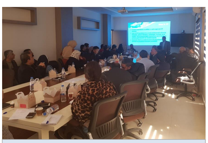
Health Cluster meeting in Gaza, held at the PMRS premises.

and partners assessed 2,048 persons with injuries, out of whom 1,984 (1,941 males and 43 females) have received multidisciplinary rehabilitative services. 248 persons with injuries (244 males and 4 females) have been readmitted again to receive other cycles of rehabilitation intervention as per their wounds conditions. Those injured benefitted from 37,250 multidisciplinary sessions. HI has also distributed 725 assistive devices including wheelchairs, elbow and axillary crutches, and anti-bed sore mattresses.